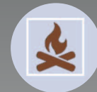
FIRE & HEAT

CEMLUX fiber cement products are resistant to: