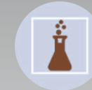
MOST ACIDS AND CHEMICAL PRODUCTS